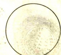
OWNER'S NOTARY SEAL