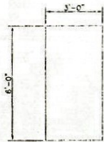
TYPICAL LOT & SPACE DIMENSIONS