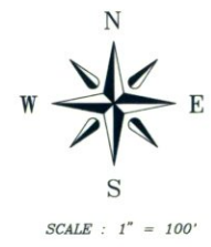
SCALE: 1" = 100'