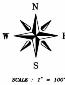
SCALE: 1" = 100'